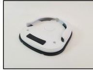
Magnetic Mounting Shoes* GT-16301 - White GT-16303 - Black