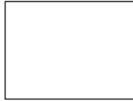
Golight GT LED Insert 15444