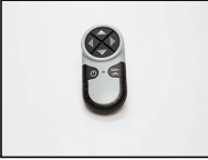
Wireless Handheld Remote 30100