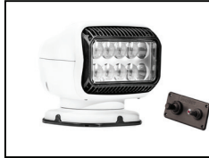
GOLIGHT GT LED 20204GT (White) 20214GT (Black)

Package Includes: Wireless Handheld Remote Mounting Hardware