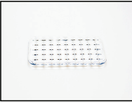
Snap-On LED Flood Lens 15420