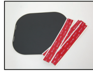
Mag Base Adapter Kit 16308