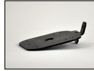
Jeep Mounting Bracket 16311 - Drivers Side 16312 - Passenger Side