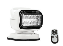
GOLIGHT GT LED 79004GT (White)

Package Includes: Wireless Handheld Remote Magnetic Mount Shoe & Suction Cup 15' Power Cord with Cigarette Plug