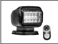
GOLIGHT GT LED 20004GT (White) 20514GT (Black)

Package Includes: Wireless Handheld Remote Mounting Hardware