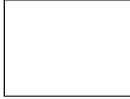
Hardwired Dash Mount Remote GT-2020-D