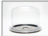
Security Dome ** 17920