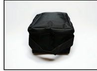
Nylon Carrying Case 18000