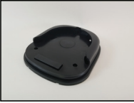
Permanent Mounting Shoes* GT-15202 - White GT-15203 - Black