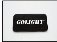
LED Snap On Rockguard 15309 - White 15310 - Black

*Mounting Shoes for use with Portable Mount Models Only **Security Dome for use with Permanent Mount Models Only