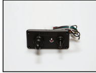
Hardwired Dash Mount Remote GT-2020-D