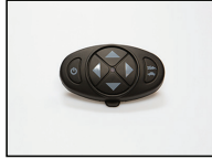
Wireless Dash Mount Remote 30200