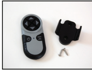
Remote Holster 30111 Remote Not Included