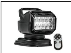
GOLIGHT GT LED 79014GT (White) 79514GT (Black)

Package Includes: Wireless Handheld Remote Magnetic Mount Shoe & Suction Cup 15' Power Cord with Cigarette Plug