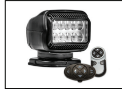
GOLIGHT GT LED 20074GT (White) 20574GT (Black)

Package Includes: Hardwired Dash Mount Remote 20' Wiring Harness Mounting Hardware